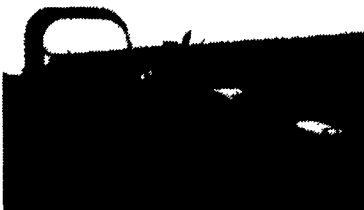
JD 350C New V.G., $13,000, — Also JD 350B, $8,800 —

Case 580CK Backhoe..... $4,800 Case 850 Crawler Loader w/Ripper, Good U/C..... $9,800 Case 1150B Crawler Loader, New Pins, Bushings, Sprockets, 4-In-1 Bucket..... $13,000 Cat D4 Crawler Loader..... $4,500 Cat 951C Crawler Loader... $11,500 Ford 4500 wheel loader ..... $5,000 (Backhoe available) Ford 4500 TLB..... $7,000 IH T340 4N1 Crawler Loader..... $3,750 JD 300B TLB ..... $7,800 JD 350B Crawler Loader, Excel..... $8,800 JD 350C Crawler Loader, New U/C, Rebuilt Trans. .... $11,000 JD 410 Loader Backhoe.... $10,000 JD 450C Crawler Loader... $12,500 Komatsu D65S Crawler Loader..... $10,500