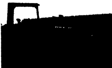
Case 1150B 4 In 1 Bucket, $13,000

8422 Wayne Highway Waynesboro, Pa. 17268 717-762-3193