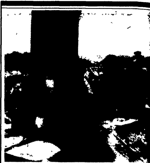
Montgomery HD 34 Wood Hog