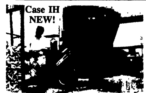
105 Bushel Model 1250 In Stock VERY REASONABLE PRICE!

Loader In Stock At A Great Savings - SEE US NOW -DON'T WAIT IF YOU WANT A BARGAIN!