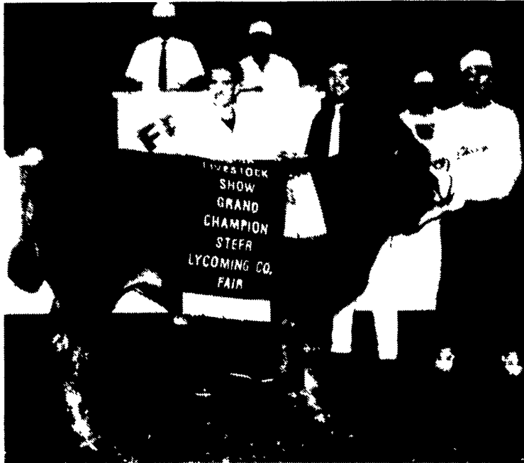
The Angus cross grand championship market steer, purchased by Hoss's Steak and Beef, from Doug Marquardt.