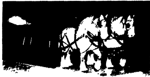
Handcrafted Grain Wagon & Horses