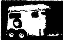
Two Horse Thoroughbred Deluxe