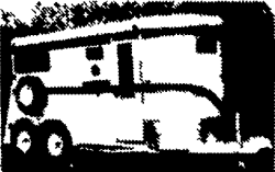
Two horse with 5 ft. dressing room