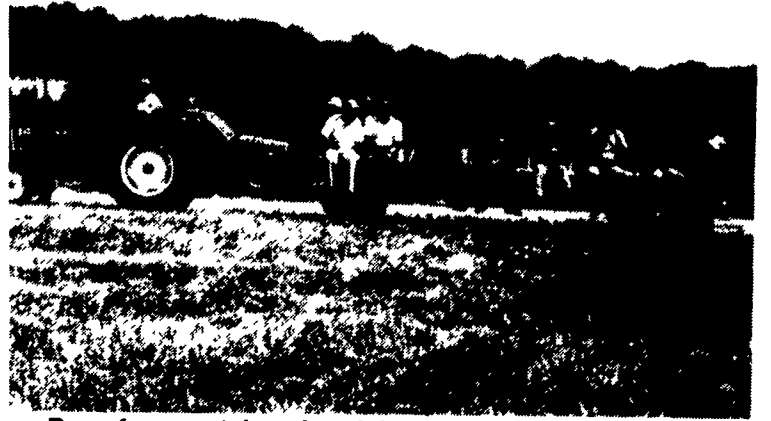
Busy farmers take a break by riding the EZ-Trail wagon bed pulled by the Fiat 45-66 over the mile long stretches of Timothy Hay at the Hay Day.