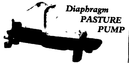
See our ads for other Rife products in this issue

RIFE P.O. Box 857LF Montgomeryville, PA 18936 (215) 699-8870