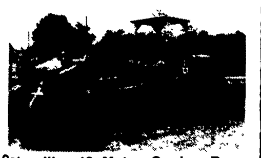
Caterpillar 12 Motor Grader, Runs Great $4,000.00