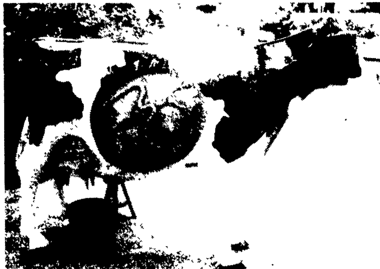
Kids got the chance to see a life-sized model of a cow and her four stomachs.

During the grand opening, special events were held throughout the day, such as a "Cow Mooing" and a "Name the Baby Calf Contests." Nutrition presentations helped the kids learn about the food groups. Children were also treated that day to free ice cream and to the opportunity of seeing a real cow milked.