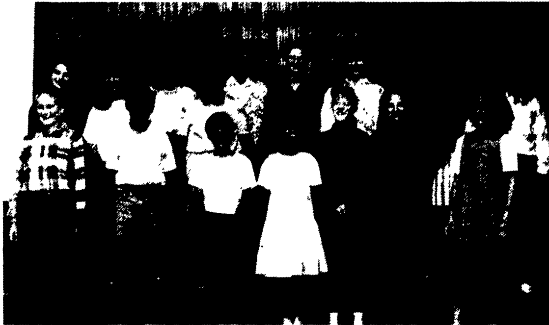
Cumberland County 4-H'ers participating in Speak-Out learn to speak with confidence.