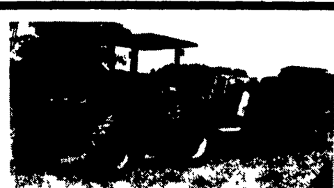
CASE IH 2096 4x4 w/Loader, Warranty $14,500 WOODS BATWING MOWER 20' Demo $9,500 410-833-9091