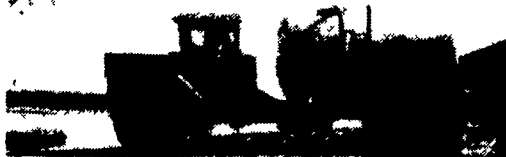
3500 gal. Pres-Vac Tank Manure Spreader 3208 Cat Diesel Allison Automatic Also Available With Dry Spreader