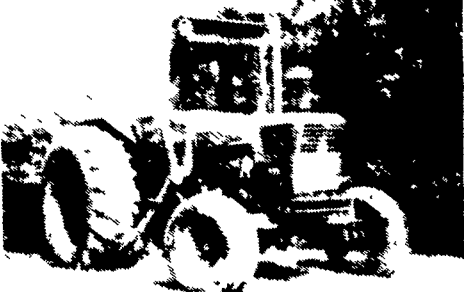
Deutz 130-06 w/Cab, 4,300 Hrs. $7,500