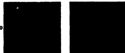
Before A hole is worn completely through the silo wall. After With the hole repaired by Shotcrete and a new surface applied, the silo is ready for years of use.