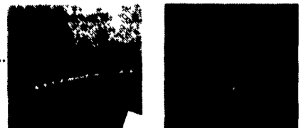
Before The bottom part of the staves are completely worn away. After The Shotcrete System repairs and replaces the missing structure.

Shotcrete is also good for repairing stone walls