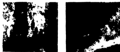
Before The silo's interior with plaster damaged and stave exposed. After The surface is reconditioned, and a new, thick, tough surface will protect stored feed.