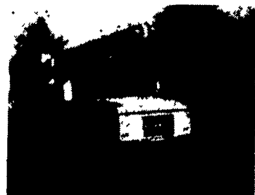
Bucket Truck L-40 ASPLUNDH, single man bucket, 45' working height. We also have L-36 Bucket, call for specs.