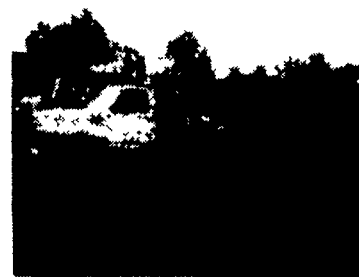
Flat Beds we have large selection of them. Knuckle Booms, or Pitman Booms with 11,000 pounds capacity, lift gates, 16'-20' beds all trucks inspected and ready to work.