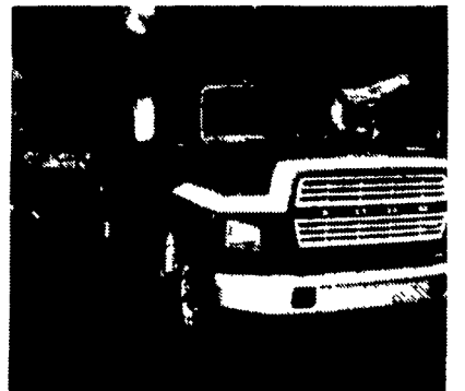
Dump Truck One of several - 1981 Ford F-600, gas, auto. We also have five man cabs with dumps and air compressors.