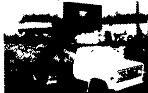
Very Rare - 85 GMC, 7000 16' Flat Bed Scissor Lift & Dump, 368 V8, 5/2 Spd Trans, PS, 32,000 GVW, Air Brakes, 82,000 Original Miles