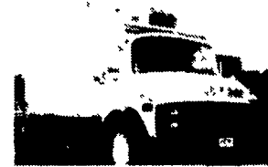
1986 Mercedes 1117 14' Thermo King Reefer w/Stand By Diesel, PS, Air Brakes, Cab, AC, 25,000 GVW, (No CDL License Required), New Paint & Inspection, Ready To Go To Work.