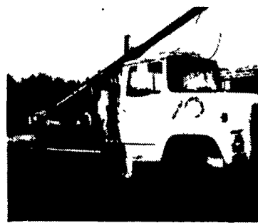
PRESSOR DIGGER Start your own business with this money maker. All wheel drive, Ford with highway digger, also rear mounted winch. Several to choose from, starting at $12,000.00. Pictured above.