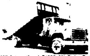
1987 International S1900 20' Stake Body Dump (Lumber Body With Bulk Head & Tie Downs) DT 468 Dsl., 5/2 Spd, 33,000 GVW, Air Brakes, PS, Steel Deck Over Wood, Fleet Maintained, Ready To Go To Work