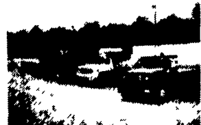
Over 20 Stakes and Stake Dumps To Choose From. All Different Sizes, Prices Starting At $3,900.