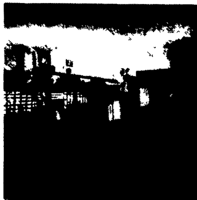
20 Ton P&H Crane 3 Sec. Hyd. Boom mounted on a 1968 F.W.D. both engine gas (new front 89), fleet maintenance.