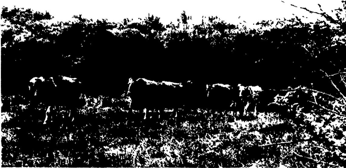
According to Bud Hamilton, the herd, on DHIA, averages 13,000 lbs at 4.6f, 3.5p. Here, the herd is moved from the paddocks to the milking barn.

to the cows out in a large open paddock.