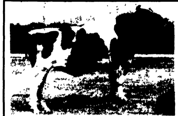
Fair-Hill TRANSFORMER 2018627 EX-90 Born 12/26/85 aAa 4 3 2 5 1 6 DMS 3-5+5/1-4 Acquired from Fair Hill Farm, Chestertown, MD