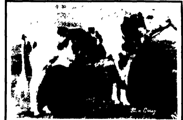
Lylehaven ROTATE AMOS 2002229 GP-81 Born 11/9/85 aAa 4 3 2 5 1 6 DMS 2-4+4/6-3 Acquired from Golden Genes, Inc., Riverdale, CA