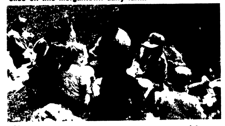
After the tour, the third graders sampled chocolate milk and ice cream.