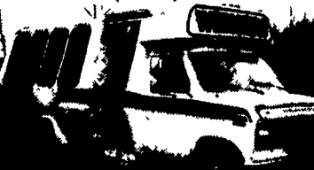
1985 Ford E350 16 Passenger Bus, Dual Air, Dual Heat, 460 V8, Auto, Chrome Bud Wheels, Radio, Dual Tanks, Current Inspection, Runs Good.