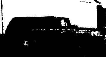
1988 Chev. Suburban-Silverado- 4x4; 350 EFI, Privacy Glass- Running Boards, Auto, CC, Pdl., RWD, Dual Air, Tilt, AT Tires, AM-FM Cassette, PW, 2 Captains Chairs, 8 Passenger Seating, 2 Tone Blue, 72-K Miles, New Inspection, AT Tires.