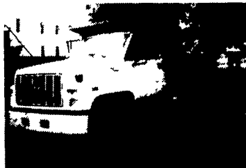
90 GMC Topkick, 2,000 Mi., Flatbed w/Dump, Like New Cond.