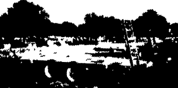
1992 5 Ton Tag-A-Long, All Wheel Brakes, Adjustable Hitch, Adjustable Ramps, 16' Bed - Never Used, Never Titled.