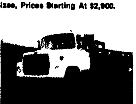
Diesel 1982 Ford LN7000 22' Stake Body, 3208 Cat Diesel, 5/2 Spd, Air Brakes, 36,000 GVW, Excellent Condition.

TWO ACRES OF ALL TYPES USED TRUCKS. "IF WE DON'T HAVE IT, WE'LL GET IT"