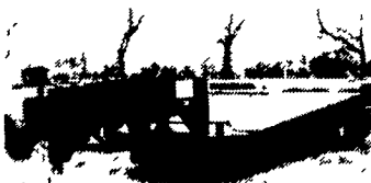
King Gooseneck Trailer, BUD Wheels, 30,000 GVW, Beavertail.