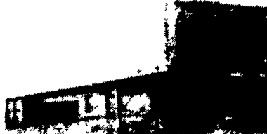
72 Fruehauf 43' Flat, Tandem Axle.