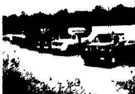
20 Stake Bodies In Stock. All Different Sizes, Prices Starting At $2,900.