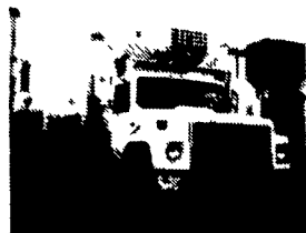
Dal, 88 Int. $1600 14' Ref. With T/K Self Contained Dst. Unit, 5 Spd., 24,500 GVW, 51,000 Orig. Miles, Exc. Cond., Avail. For Sale Or Lease.