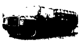
Diesel 1983 Int. $1754 14' Stake Body Crew Cab, Flip Up Power Lift Gate, Int Dst, Allison AT, PS, 38,000 Miles, In Excellent Condition