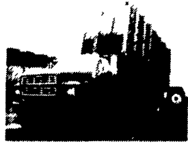
1985 Ford F700 14' Stake Dump 370 V8, 4/2 Spd. Trans., PS, PB, 38,000 Miles, In Like New Condition.