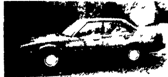
1985 Honda Accord LX, 5 Speed, PS, PB, Air, AM-FM Cassette, Current Inspection, Charcoal Grey, Very Nice In & Out. Choose From 3