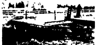
1979 General 3 Axle Tag-A-Long Trailer, 24,000 GVW.