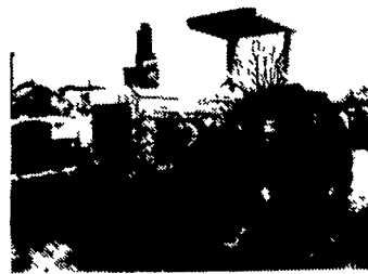
Oliver 1950 GM Diesel, 4 Wheel Drive, ROPS, PTO, No 3 Point, Runs Fair.