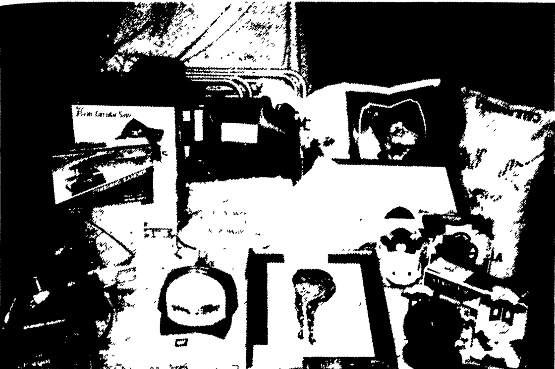
Some of the items that will be for sale at the first Cumberland County junior livestock auction set for May 30 at the Newville Fairgrounds.

Still, she said, at least the youngsters will get the chance to earn some well-deserved recognition for their hard work.