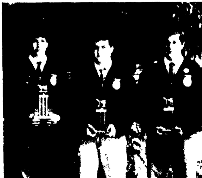
Manor FFA Dairy Team won first place at the recent Delaware Valley College Dairy Judging Contest.

LEHIGH AG EQUIPMENT Weacoaville, PA 215-398-2553