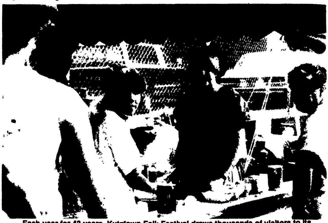
Each year for 43 years, Kutztown Folk Festival draws thousands of visitors to its nine-day observance of colonial crafts, foods, entertainment, and reinactments.

val; 461 Vine Lane; Kutztown, Pa. 19530. We will send a brochure with activities listed and a map of the Festival Grounds.