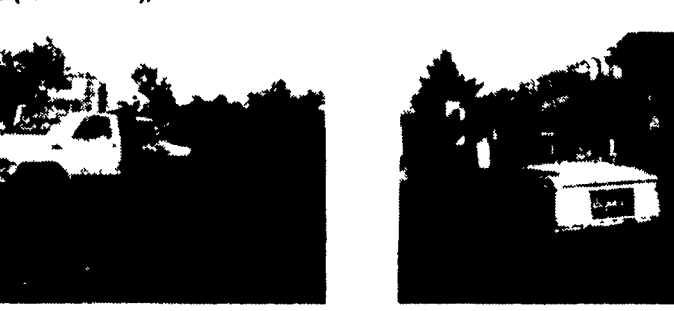
Flat Beds we have large selection of Bucket Truck L-40 ASPLUNDH, single them Knuckle Booms, or Pitman Booms man bucket, 45' working height. We also with 11,000 pounds capacity, lift gates, have L-36 Bucket, call for specs. 16'-20' beds all trucks inspected and