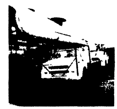
HIGH RANGER 70' working height, two man bucket, this unit was fleet maintained. We have service records. Rebuilt engine 5/2 trans on Chevy Inspected.

DIGGER DERRICKS/AERIAL BUCKETS/UTILITY EQUIPMENT