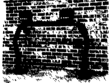
6"x9" With Lights $199 00

Light Bar Tubular steel, black powder coated Supports light sets and comes with attaching hardware and installation instructions