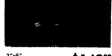
3"x5" With Lights $149 00

Light Bridge High-tech black polymer light bridge designed for that off-road look Comes complete with all attaching hardware and installation instructions.