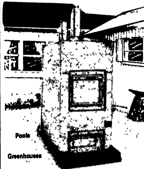
Ideal For New Construction And Existing Homes

(800) 582-7554, 717-764-4359 or 259-9929