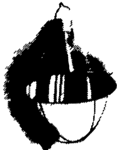
BROODER WITH 6' CORD & WIRE GRILL HEAT LAMPS - RED OR WHITE AVAILABLE

Complete With Guard And Hanger Two Piece Porcelain Replacement Socket With Screw Terminals