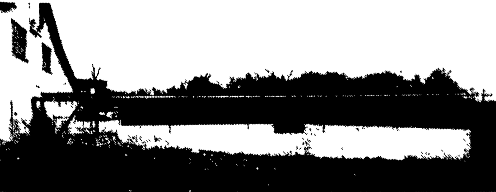
50' x 65' Rectangular Manure Storage With Pit Entrance Ramp

Specializing In Manure Storage Round or Rectangular, In Ground or Above Ground