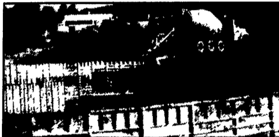
Construction Of Partially In-Ground Liquid Manure Tank - 400,000 Gallons