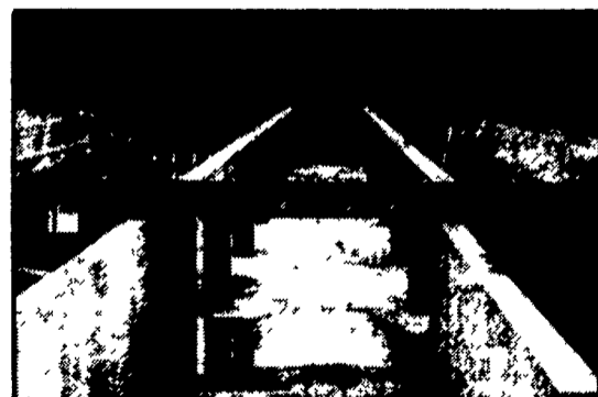
Concrete Pit Set-Up For Slatted Floors

Invest in Quality - It will last a lifetime.