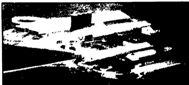
Far Left: 1-Million Gallon Circular Manure Storage Tank Far Right: 2 Silage Pits In-Barn Manure Receiving Pit