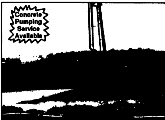
92' Boom Placing Concrete