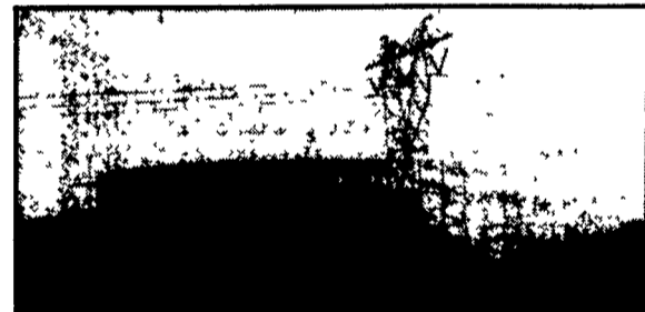
Above Ground Liquid Manure Tank 425,000 Gallons