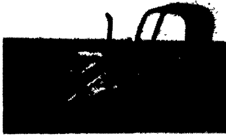
(3) JD 450C $12,500/Choice

Industrial VAC or VAI and high crop VAC and wide front VAC Many miscellaneous brands also available Also many older hard to find toy tractors and newer collector additions, call with your "want list, if we don't have it, we'll get it."