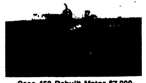
Case 450 Rebuilt Motor $7,200