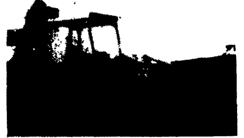
'82 JCB 1550 $7,500