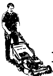
W 021-SC Walk Behind Mower

GOATS 34... Large 35.00-64.00, Small Mainly Kids 13.00-24.00. --- all per head. HOLSTEIN DAIRY COWS... $900.00-1300.00, few 1625.00. --- PER HEAD.