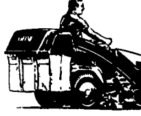
G2000 with Grass Catcher