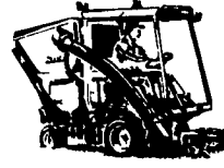
F2400 with Grass Catcher