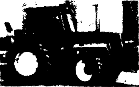
AC 8070 4x4, Power Shift, 2,332 Hrs. $23,000