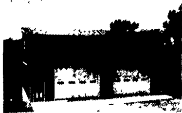
Use On Garages, Horse Barns, Etc.