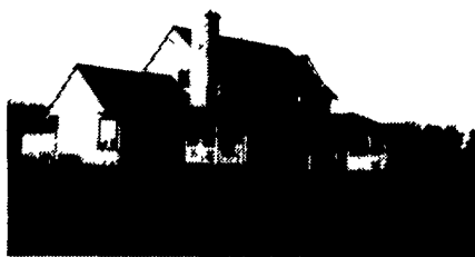
Good For All Roof Angles