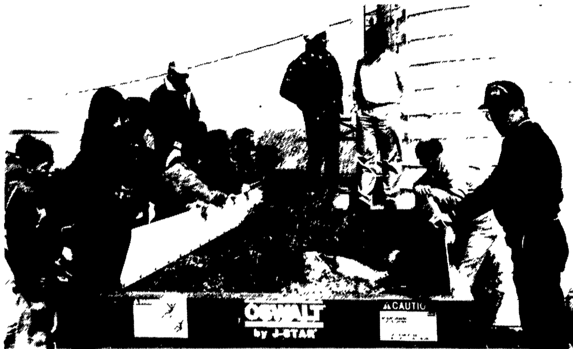
Farmers gather around the mixing demonstration at Lapp's Barn Equipment.

Information on available testing and a new fee structure will be mailed to potential users later this month. In the meantime, questions concerning laboratory services should be directed to the individual laboratories or to the Animal Health and Diagnostic Commission Office in Harrisburg (717) 782-2852.