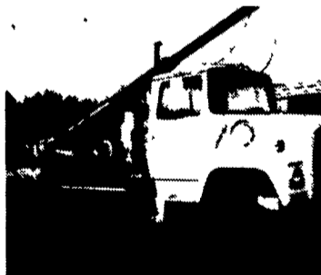
PRESSOR DIGGER Start your own business with this money maker. All wheel drive, Ford with highway digger, also rear mounted winch. Several to choose from, starting at $12,000.00. Pictured above.