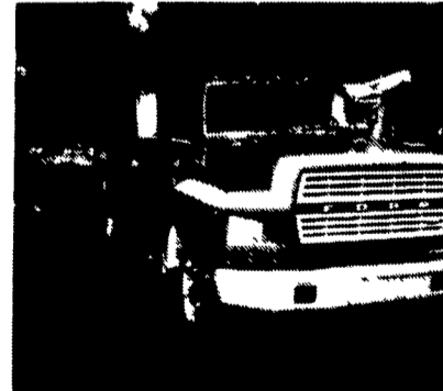
Dump Truck One of several - 1981 Ford F-600, gas, auto. We also have five man cabs with dumps and air compressors