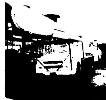
HIGH RANGER 70' working height, two man bucket. this unit was fleet maintained. We have service records. Rebuilt engine 5/2 trans on Chevy Inspected.