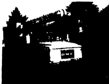
Bucket Truck L-40 ASPLUNDH , single man bucket, 45' working height. We also have L-36 Bucket, call for specs.