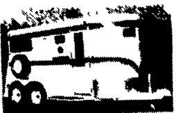
Two horse with 5 ft. dressing room