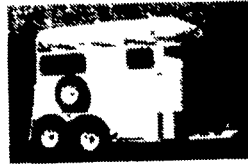
Two Horse Thoroughbred Deluxe

SPRING PRICES ON SILAGE BAGGERS FOR UNDER $12,000 Also Bags See Page D47 For Details