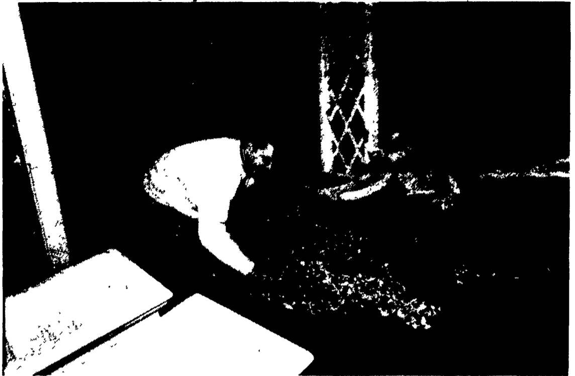
A landscaper prepares a mulch bed in preparation for the annual Philadelphia Flower Show, which begins Sunday.

The Philadelphia Flower Show will be held at the Philadelphia