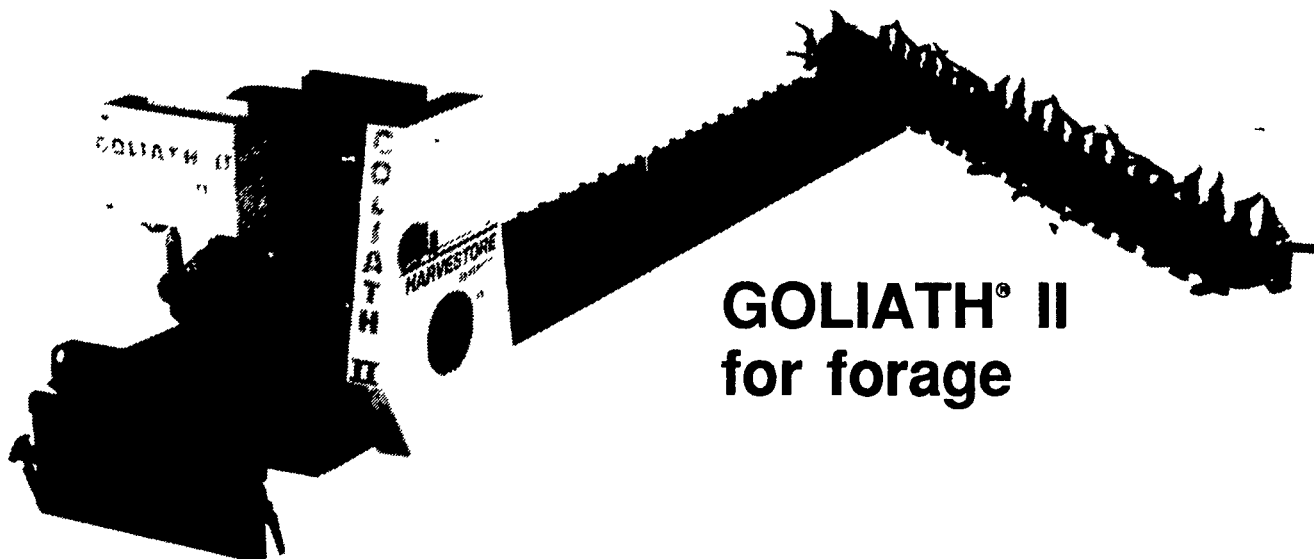
GOLIATH® II for forage