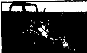
JD 450 C Crawler Loader w/like new bottom