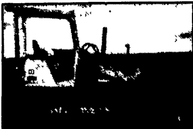
CAT 931B 4 In 1 $11,000