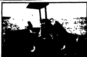
Case W4 w/bucket & forks

Sales, Parts And Service For... ★ CASE UTILITY ★ GEHL ★ VICON ★ WFE ★ KUBOTA ★ HESSTON ★ SAME