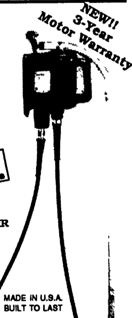
MADE IN U.S.A. BUILT TO LAST