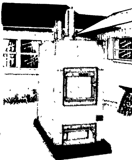
Hardy Outside Wood Furnace Heats Your Home And Your Hot Water

(800) 582-7554, 717-764-4359 or 259-9929