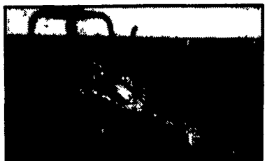
JD 450 C Crawler Loader w/like new bottom $13,000

Case 580B extend-a-hoe, nice original machine $8,700 Case 450 Crawler loader, ROPS & sweeps, new pads, pins & bushings $5,800 '85 MF 30E loader backhoe w/3 pt. and PTO, 1200 Hrs. $9,500 Ford 4500 diesel loader w/ rebuilt motor $5,000 Case W4 w/bucket & forks $7,500 JD 93 Backhoe attachment $3,000