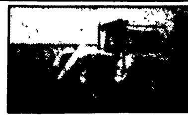
79 JD 310A excellent rebuilt motor w/warranty $10,000

Cat 931B 4-in-1, $11,000 '81 JD 555 crawler loader, excellent rebuilt bucket $14,500 JD 450 crawler dozer, 6-way blade, rebuilt engine & steering clutches, $7,800 JD 450, good u/c, 4 in 1, rebuilt motor & steering clutch $8,000 JD 450 C crawler loader w/like new bottom $13,000 JD 350 gas crawler loader $4,000 JD 310A backhoe, full cab, rebuilt motor w/warranty, excellent $10,000 JD 310 backhoe, rebuilt motor w/warranty $7,500 Case 1845 skid loader, good condition, $7,000