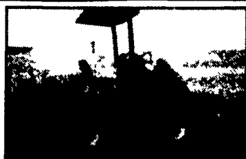
Case W4 w/bucket & forks $7,500

KERMIT K. KISTLER, INC. RT. 143 LYNNPORT, PA. 18066 215-298-2011