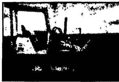
CAT 931B 4 in 1 $11,000

Cat 931B 4-in-1, $11,000 '81 JD 555 crawler loader, excellent rebuilt bucket $14,500 JD 450 crawler dozer, 6-way blade, rebuilt engine & steering clutches, $7,800 JD 450, good u/c, 4 in 1, rebuilt motor & steering clutch $8,000 JD 450 C crawler loader w/like new bottom $13,000 JD 350 gas crawler loader $4,000 JD 310A backhoe, full cab, rebuilt motor w/warranty, excellent $10,000 JD 310 backhoe, rebuilt motor w/warranty $7,500 Case 1845 skid loader, good condition, $7,000