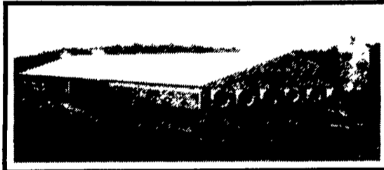
FEEDER PIG OPERATION