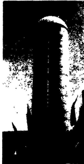
"This is The Kind Of Silo You Need To Store Your Valuable Forages."

WE HAVE THE STRUCTURE YOU NEED FOR SILAGE STORAGE - HAY OR WILTED GRASS STORAGE - HIGH MOISTURE GRAIN STORAGE - LIQUID OR DRY MANURE STORAGE - OR ALMOST ANY MATERIAL NEEDING STORAGE.