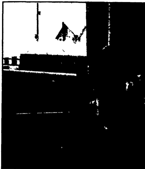
Notice heavy crust on top of pit.