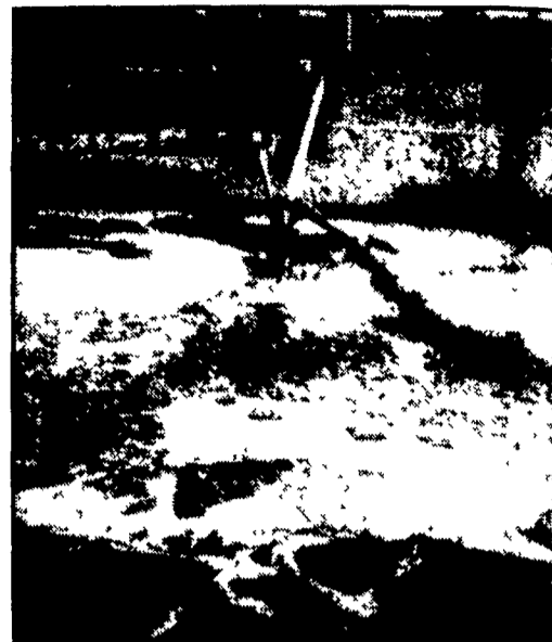
Pit is completely agitated and ready for spreading.

This pump will not only pump but will also agitate by using its rear mounted propeller allowing you to mix and agitate your pits in less time.