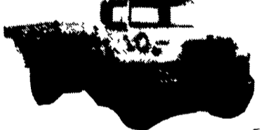
87 Ford L8000, 3208 Cat, P/S, A/B, 5 & 2 Spd., 16' C & C.... Call For Details