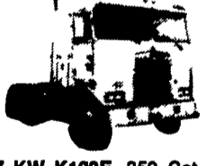
86-87 KW K100E, 350 Cat, 9 Spd., P/S, A/C, 8 Bag Air Ride, Reyco Spr. Susp. .... Starting at $13,900