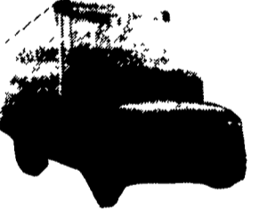
85-86 IHC S1954, DT466 5 Spd., P/S, A/C, A/B, 28,000 GVW, 24' Van Body..... Starting at $11,500