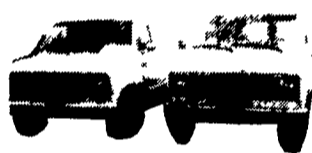
82-83 Ford E-350, 6 Cyl., A/T, P/S, P/B, 1 Ton Vans.. Starting at $1,100

Dependable Used Trucks from Reliable People