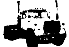
85-86 Ford L9000, 300 NTC, 9 Spd., P/S, A/C, Hend. Spr. Susp. Spoke Wheels..... Call For Details