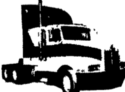
87 KW T600A, NTC 400 9 Spd., P/S, A/C, 8 Bag Air Ride, 42" Splr., Recent Overhaul..... Call For Details