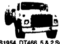
87 IHC S1954, DT466, 5 & 2 Spd., P/S, A/C, A/B, 32,000 GVW, 24' Van With L/G ..... $15,500 As C&C Only ..... $14,500