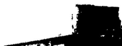
72 Fruehauf 43' Flat, Tandem Axle. $2,200