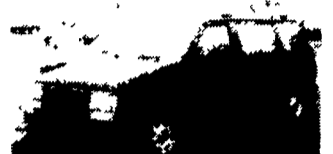
1989 Dodge Caravan LE, V6, Automatic, 7 Pass, Elec. Windows, Locks, Cruise, Tilt, AM-FM Cass., Black 68,000 Miles, Air, Privacy Glass $8,995.00