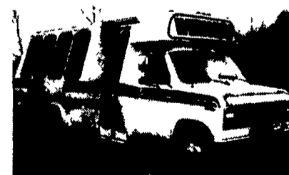
1985 Ford E350 16 Passenger Bus, Dual Air, Dual Heat, 460 V8, Auto, Crome Bud Wheels, Radio, Dual Tanks, Current Inspection, Runs Good. $9,250

HOURS: MON-FRI 7:30 To 5:00 SAT 7:30 To NOON