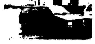
1989 Grand Voyager SE V6, Auto, Air, Elec. Locks, Privacy Glass, Charcoal, 65,000 Miles. $8,500.00