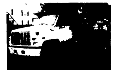
90 GMC Topkick, 2,000 Mi., Flatbed w/Dump, Like New Cond. $21,500