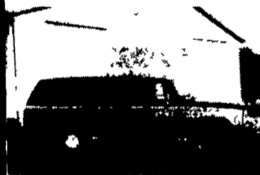
1988 Chev. Suburban-Silverado- 4x4; 350 EFI, Privacy Glass- Running Boards, Auto, CC, Pdl., RWD, Dual Air, Tilt, AT Tires, AM-FM Cassette, PW, 2 Captains Chairs, 8 Passenger Seating, 2 Tone Blue, 65-K Miles, New Inspection, AT Tires, 74 Codes In Glovebox. $13,900