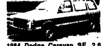
1984 Dodge Caravan SE, 2.6 Auto, Air, 7 Pass, Elec. Windows, Locks, Cruise, Tilt, Air, AM-FM Cassette, 101,000 Miles, Beige $3,595.00