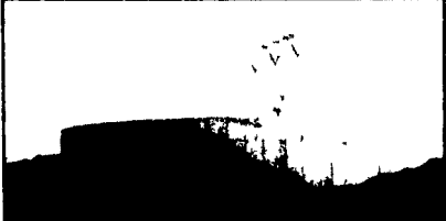
Above Ground Liquid Manure Tank 425,000 Gallons