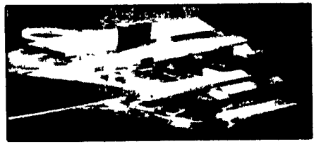
Far Left: 1-Million Gallon Circular Manure Storage Tank

17 Years Experience In Pouring Concrete Manure Pits!