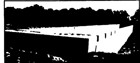
300' Long Manure Pit For Hog Confinement