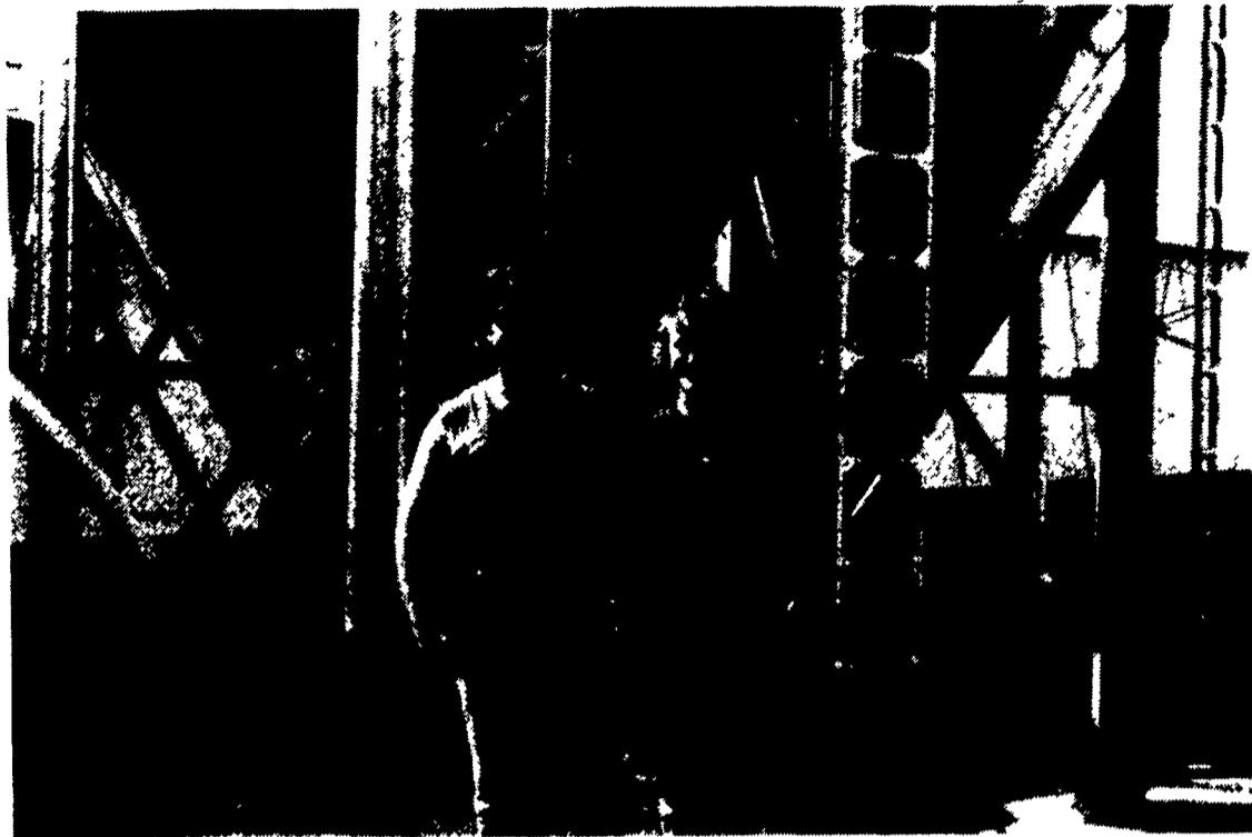
PICTURE ON LEFT SHOWS BIRDS BEING HOUSED ON OCTOBER 10, 1991. BIRDS WERE MOVED OUT ON NOVEMBER 28, 1991

CONGRATULATIONS STEVE AND CAROL EBERSOLE, CONESTOGA, PA