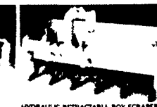
HYDRAULIC RETRACTABLE BOX SCRAPER