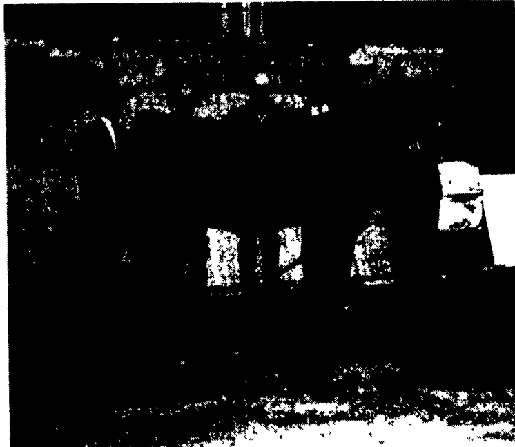
Stewman Ranches of Maryneal, Texas led out the grand champion Limousin bull at the National Western with MAGS Yarborough, a 9/2/90 Polled Power son out of MK Shelly Wood.

champion female with JCL Miss Mesa, a half-sister, a 3/23/91 Polled Power daughter out of SWPL Navajo Maiden.