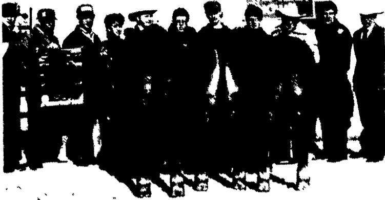
Cane Ridge Farm of Paris, Ky. exhibited the grand champion pen of three Limousin bulls at the National Western in Denver.

Top Line, SY Polled Satisfaction and WLCC Turbo. The March and April of 1991 bulls were an average frame score of 7.1, 29.2 cm. for scrotal measurement and 13.4 sq. in. for ribeye.