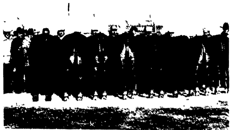
Magness Land and Cattle of Platteville, Colo. teamed up with Flying Dog Ranch of Woody Creek, Colo. to exhibit the grand champion carload of Limousin bulls at the National Western.

Yackley-CMC Limousin of Onida, South Dakota exhibited the reserve grand champion carload with bulls sired by YKCC Bandito, PMDB Adonis, Gretzky, Polled Sky Cat, YKCC Atlantic, YKCC