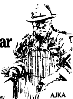
Rancher and actor Wilford Brimley John Deere Day 1992 Spokesperson

To celebrate another year of working together, let's get together.